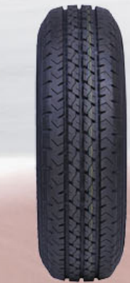
SS200 Page 16