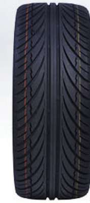
KF397 Page 13