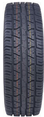
ROADGRIP H-TM+S Page 09