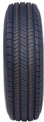
ROADCLAW H-TM+S Page 08