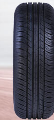
SS300 Page 17