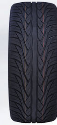
KF770 Page 12