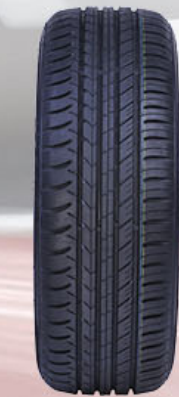
SS900 Page 18