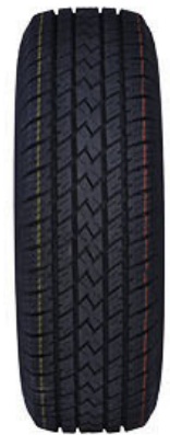
MAXCLAW H-TM+S Page 05