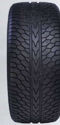
KF990 Page 11