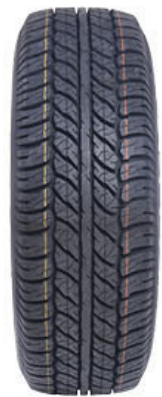
MAXCLAW A-TM+S Page 07