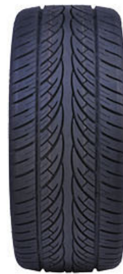
KF997 Page 10