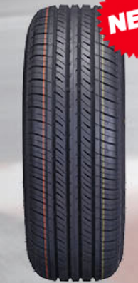
KF233 Page 15