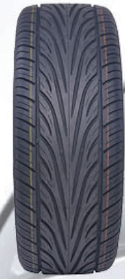
KF380 Page 14